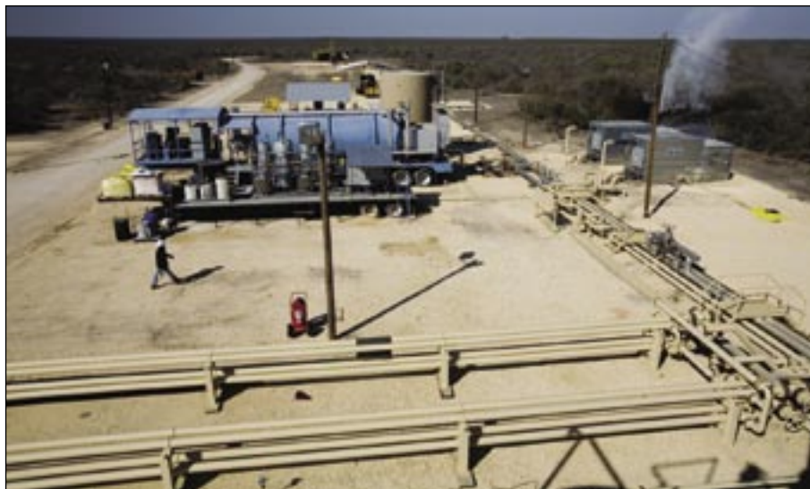
Gas-fired steam generator and tank battery at TXCO Resources-Pearl E&P two-well tar sand pilot in Maverick County, Tex.

TXCO and Pearl hold 36,000 acres of lease rights in a 68,000-acre area of